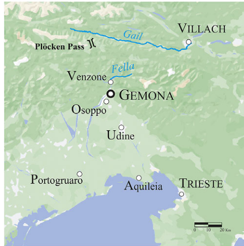
Figure 1. Gemona and the Alpine trade routes.

Emperor Conrad III of Germany stayed in Gemona with his court on his way back from the Holy Land, showing that the town was then already a major Alpine region hub (Figure 1). 10