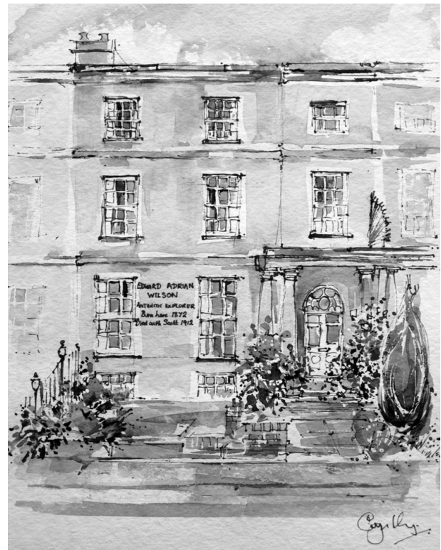
Fig. 1. 91 Montpellier Terrace, Cheltenham (watercolour by the author).

It is encouraging to note that both of these are well maintained and serve to indicate the civic pride with which Cheltenham still regards its most famous son.