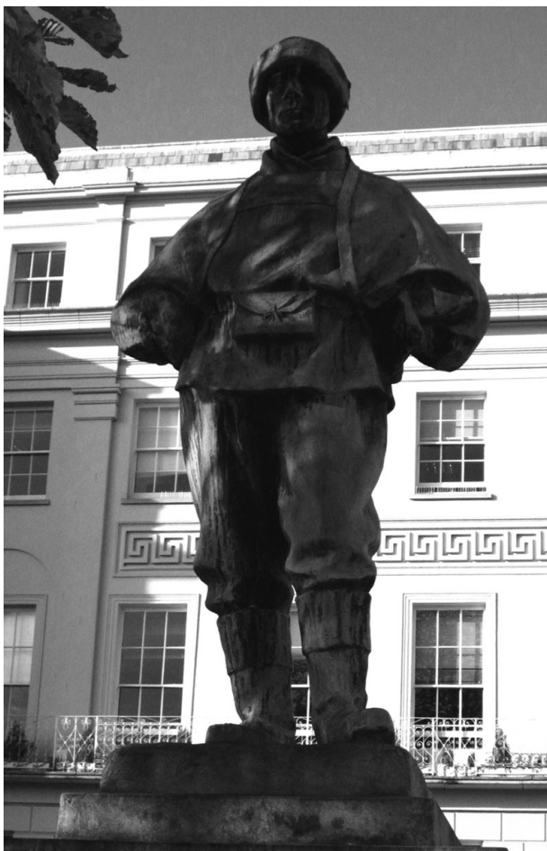
Fig. 3. Statue of Wilson by Kathleen Scott.