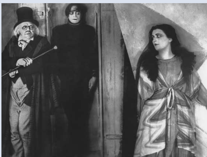
Still of evil Dr Caligari on left; somnambulist (centre) is Conrad Veidt, with Jane on right

Given this popularity and its appearance in children's animation, Jungle Book (1967) and Robin Hood (1973), hypnosis is probably the most (mis)represented of all 'psychiatric treatments' on film. It remains a popular narrative ploy, mostly in thrillers – Dead Again (1991) and the Bourne trilogy (2002–07) – where no smart money is bet on the integrity of the hypnotist. In Stir of Echoes (1999) and countless dissociative identity disorder films, hypnosis is the catalyst for libidinous mayhem. Movie hypnosis is seldom used for good ( Inner Sanctum/Calling Dr Death 1943) – as with the television news maxim, 'if it bleeds, it leads'. Its power is ferocious – in Silence of the Lambs (1991), psychiatrist Hannibal Lecter is able to induce suicide in a detested fellow prisoner whom he cannot see, separated by several layers of bars and glass. Go figure.