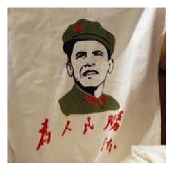
Figure 4. Mao, 'Serve the people: Wearing the Red Army Suit Obama Turned Obamao'. Sing Tao Daily Online 25 September 2009.