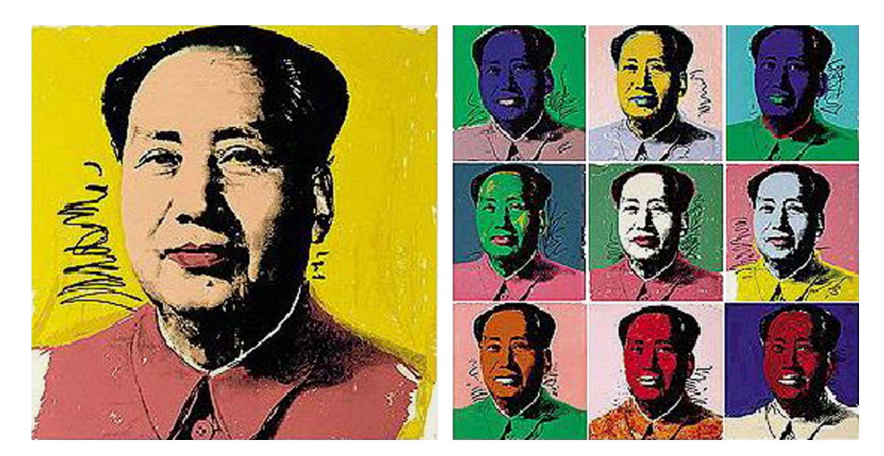
Figure 1. Mao portrait by Andy Warhol. © 2012. The Andy Warhol Foundation for the Visual Arts, Inc. / Artists Rights Society (ARS), New York.

'The ubiquitous portrait caused Mao Zedong to be looked upon as a god in China. However, in Andy's rendering, the allegorical force of Mao's portrait was made conventional, its enormity neutral, objectified, emptied of its moral value as well as its aesthetic intent'. <sup>14</sup> Warhol's deposition of the god-like chairman in his postmodern portrait from its eminent status to a technical serialization, recognized in Ai Weiwei's statement, has proliferated transnationally and has become the basis of more audacious variations of the former state portrait and its persona in the late 1980s and 1990s.