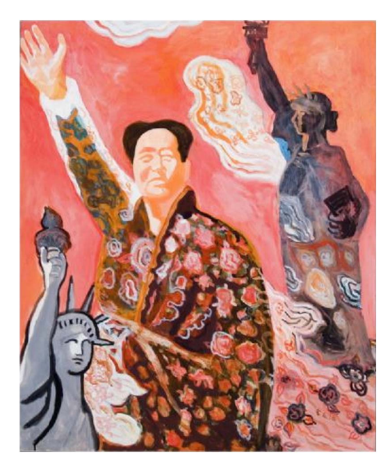
Figure 3. Yu Youhan, 'Mao and Statue of Liberty'. © Courtesy of Yu Youhan and Shanghart Gallery, Shanghai (1996).

Art critic Li Xianting sees these postmodern representations of Chinese politics as part of a new wave of 'Mao Fever' and labels them 'Political Pop.'