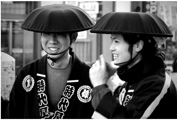
Historical reenactment. Poster advertising one of at least twenty Jack the Ripper tours in the East End. Rickshaw pullers in Asakusa.