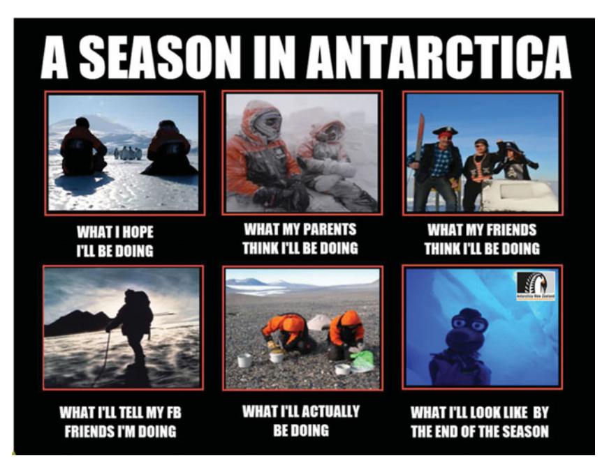
Fig. 2. Internet meme 'a season in Antarctica' by Antarctica New Zealand.

working in the Antarctic. Although these images may not best represent expeditioners' everyday activity, they do come from a long visual tradition of depicting Antarctica as a wild and extreme location.