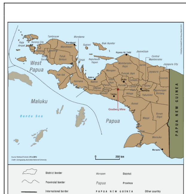
Map Two showing the territory of West Papua including the Indonesian provinces of Papua and Papua Barat (West Papua) and the administrative regions called kabupaten (regencies).

1971 up to 2000. From my calculations this meant that indigenous Papuans comprised about 48% of the entire population of West Papua (Papua and Papua Barat provinces) in 2010. The figures received from the BPS are from the 2010 census and identify the inhabitants of Papua province as either Suku Papua (Papuan tribe) or Suku Bukan Papua (non-Papuan tribe). According to these figures out of a total population of 2,883,381 in Papua Province, some 2,121,436 were Papuan (73.57%) and 658,708 Non-Papuan (22.84%), the remainder being unknown. The BPS figures for Papua Barat show that the total population is 753,399 of which 51.49% is Papuan.