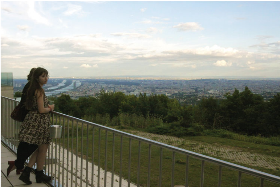
View of Vienna from Kahlenberg mountain.