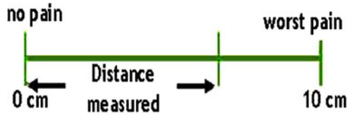
Figure 3. Pain measurement (VAS – visual analogue scale).

study in Turku. The proctors in both locations employed the same instructions and procedures.