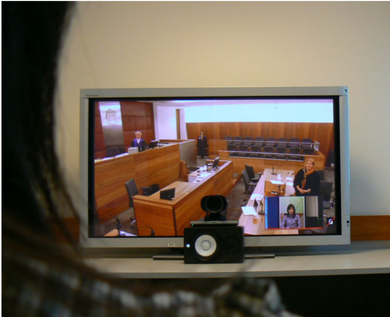
Figure 3 Overview of the courtroom with the image of the judge at the dais.

courtroom and vice versa, 28 as well as ensure that, in the planning stages of a case, documents or exhibits that will need to be shown to a witness giving evidence by video link will be available at the remote end. 29