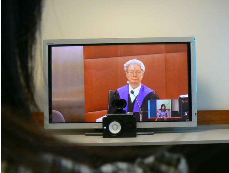
Figure 5 Image of the judge produced by a camera sitting slightly above the judge.

of the evidence that they're giving ... I think it's important to impress on the person the solemnity of the occasion and the importance of their evidence. 50