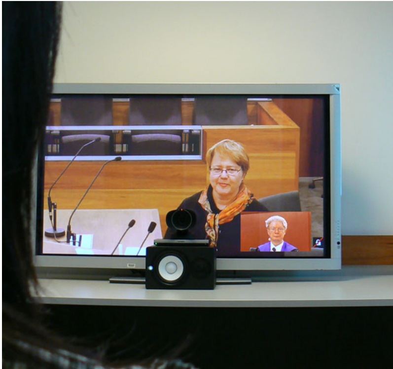
Figure 2 Picture-in-picture close-up of head-and-shoulders shot of the judge within a shot of the bar table.

image of the judge has important implications for two particular aspects of the judicial role: their management of the courtroom and their capacity to embody and project the authority of the court.