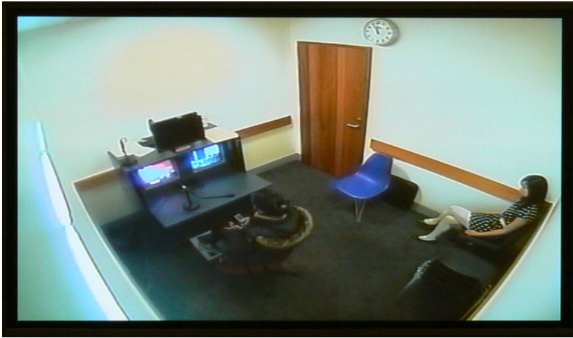
Figure 4 Example of an overview shot of a remote space, captured by a CCTV camera and visible on a separate display at the judge's bench.

questions (see e.g. No. 42 of 2008, s. 41) or when a witness becomes too distressed to continue giving evidence. Making such an assessment can require the exercise of a fine judgment, for example, as to whether a witness appears distressed, is genuinely distressed or whether that distress is the result of having their credibility successfully challenged. It appears from our data that the limitations of communication over a video link can make it harder for the judge to perceive some aspects of the witness's body language that may inform those judgments. For example, a court clerk recalled: