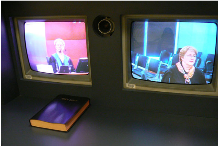
Figure 1 The judge's image appears on a separate monitor to the lawyers at the bar table.

participant in one of three ways. In the first example, a head-and-shoulders shot of the judge would take up the full screen on one of two monitors (Figure 1) or appear as one half of a split screen with the other showing a view of the bar table. 25