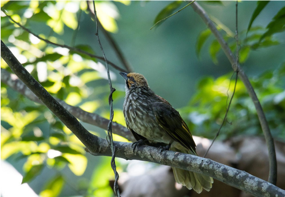
Figure 1. A Straw-headed Bulbul Pycnonotus zeylanicus in Singapore.

melodious song (Shepherd et al. 2013, Chng et al. 2016, Yong et al. 2017). Relentless trapping throughout its range has led to severe population declines (Eaton et al. 2015, Harris et al. 2017, Bergin et al. 2018) that are thought to have exceeded 80% in the last three generations (BirdLife International 2018). As a result of these declines, the species was expeditiously uplisted from 'Endangered' to 'Critically Endangered' in 2018 within a short span of two years after having been uplisted from 'Vulnerable' to 'Endangered' in 2016 on the IUCN Red List.