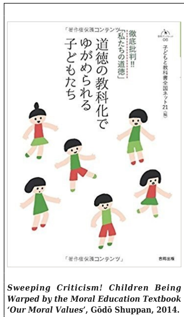
Sweeping Criticism! Children Being Warped by the Moral Education Textbook ‘Our Moral Values’ , Gōdō Shuppan, 2014.

And for fiscal 2018, approved textbooks will be published, fully carrying out the new policy. Even for 2015, in order to promote the policy before it is put into effect and the textbook published, the Ministry ordered that Our Moral Values be used as a “textbook” and that it be used jointly with the approved textbooks after