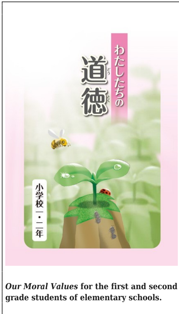
Our Moral Values for the first and second grade students of elementary schools.