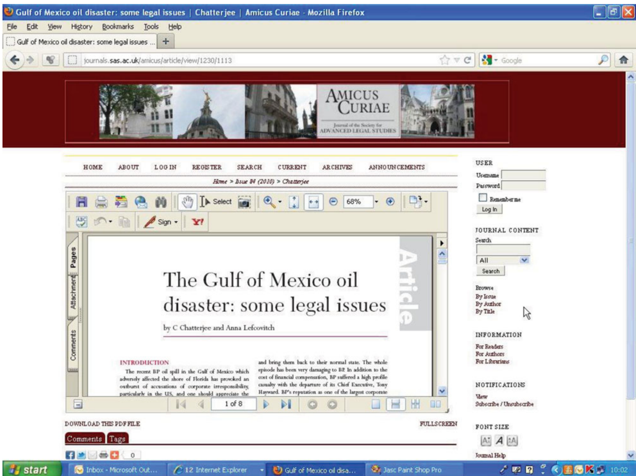
Figure 1: Amicus Curiae online in SAS Open Journal System

The open journal version of Amicus Curiae includes over 600 articles by more than 400 authors. Many of the