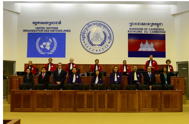
Figure 2: The ECCC trial chamber.

Purists: For legal purists, law has an important but narrow function: ‘to render justice, and nothing else’, as philosopher Hannah Arendt (2006) put it. Arendt made this claim while expressing reservations about Israel’s politicization of the 1961 trial of Adolf Eichmann, the Nazi bureaucrat who oversaw the deportation of Jews to ghettos and death camps. Doing otherwise, Arendt warned, would