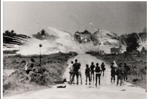
Trang Bang, Vietnam, 8 June 1972

If the doctrine of strategic bombing has been the object of much attention in the military history and international relations literature (Biddle 2002, Pape 2011), few studies have focused on the means deployed to achieve the bombings. Yet, these means are crucial to understand three decisive aspects of the doctrine and practice of strategic bombing: (1) how they have been defined; (2) how they have changed; and (3) how they have been perceived and used by different actors (militaries, international institutions and public opinion) over time (3). This article highlights these issues through the analysis of napalm utilization by the US military. It demonstrates that the massive use of this weapon, from its creation in 1942 to the Vietnam War, is at the core of a shift in the doctrine and practice of American strategic bombing. The article demonstrates that analysis of the weapons deployed for ‘strategic bombing’ enriches the historiography – and the understanding – of the doctrine and practice of strategic bombing itself.