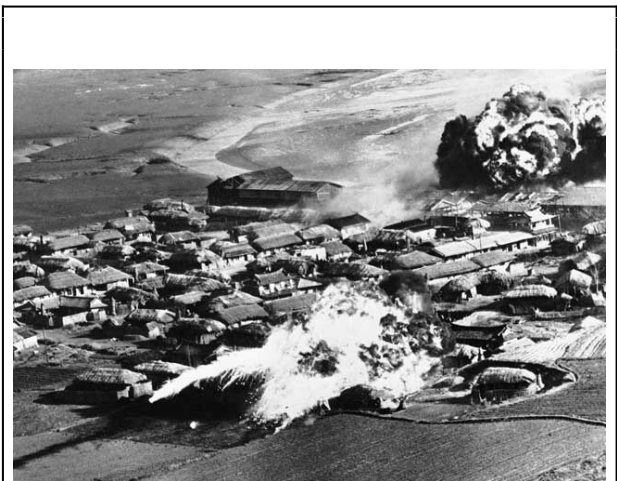
Bombing of village near Hanchon, North Korea, 10 May 1951.

delivered in such large quantities from the very first day, 26 June 1950, to the extent that the New York Herald Tribune provided this provocative headline in October 1950: "Napalm the No. 1 Weapon in Korea". 11 As the Stockholm International Peace Research Institute reported, "a total of 32,357 tons of napalm fell on Korea, about double that dropped on Japan in 1945. Not only did the allies drop more bombs on Korea than in the Pacific theater during WWII - 635,000 tons versus 503,000 tons - more of what fell was napalm, in both absolute and relative terms." 12 . At this time, napalm was regarded as a very efficient weapon to achieve area or strategic bombing, that is bombing which not only targeted a tactical infrastructure or position but covered the whole area surrounding the target.