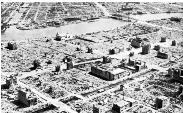
Firebombing of Tokyo, 1945