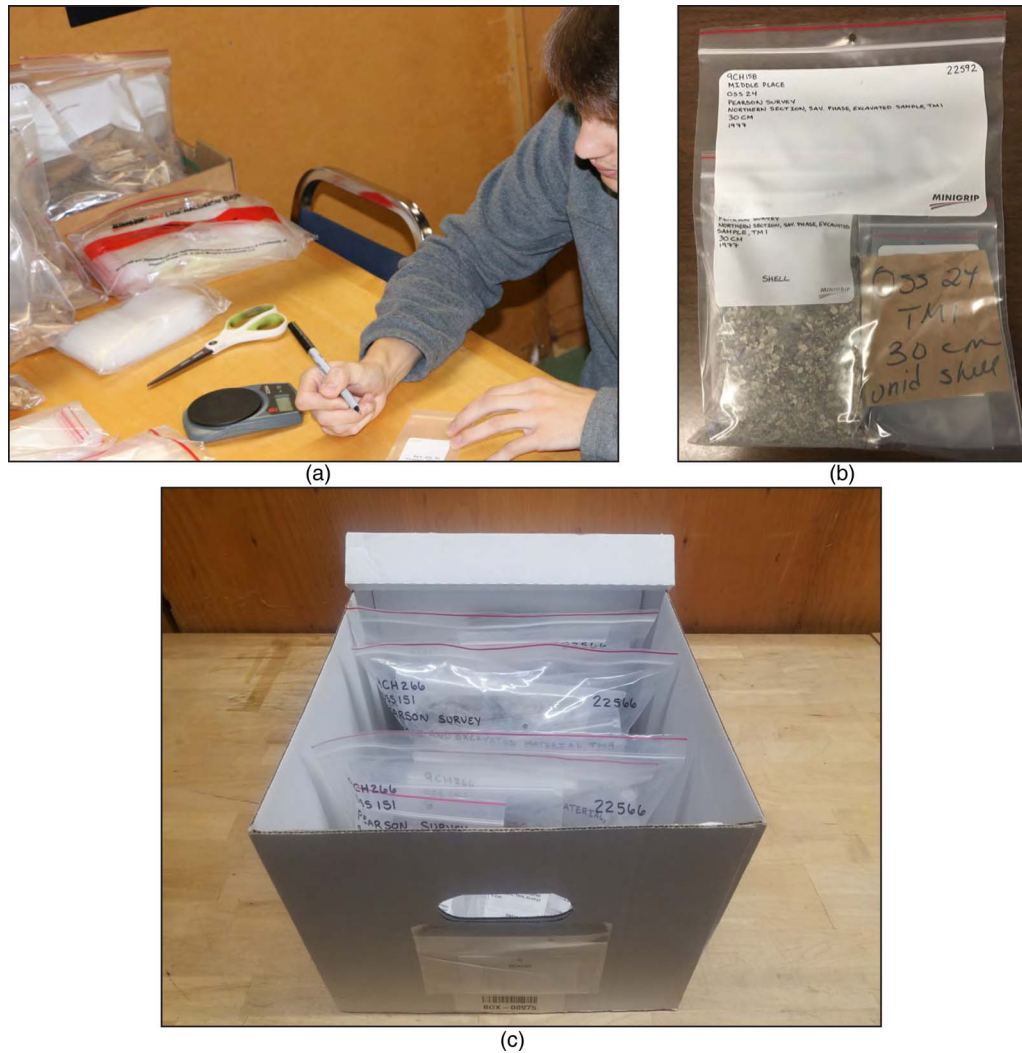
FIGURE 2. Rehabilitation Step 4 in detail: (a) collection being rebagged; (b) final bag with original and new labels; and (c) final bag organization within an archival box.

prioritizing particular collections based on size, curation condition, ownership, and funding opportunities. As a result of the initial assessment, it is now apparent that the ownership of some of our legacy collections will be more difficult to determine than others (e.g., collections from the 1940s). Additionally, the assessment also revealed collections that needed rehabilitation and that had easily determined ownership (discussed in more detail below).