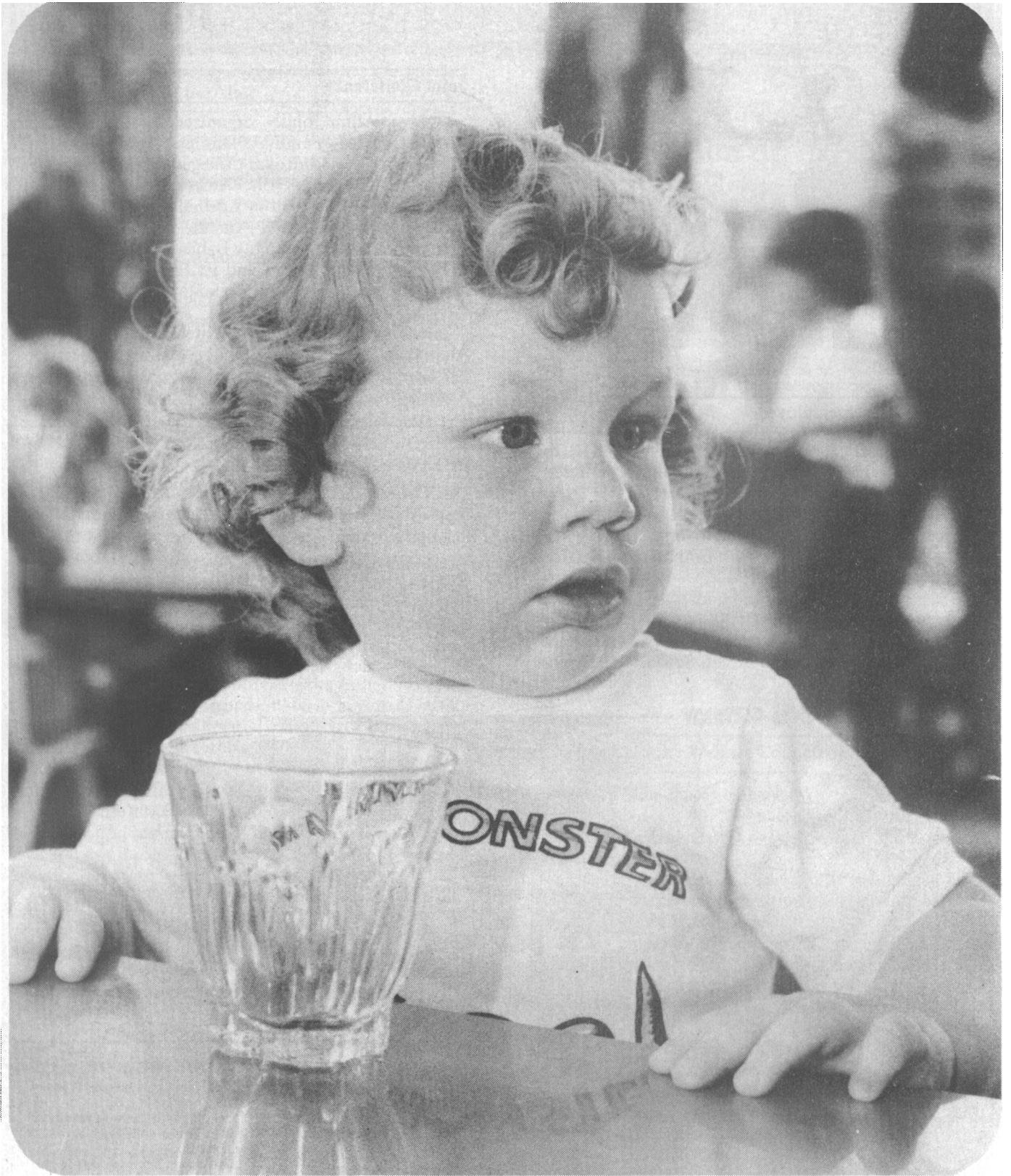
“Didn’t touch the sides”