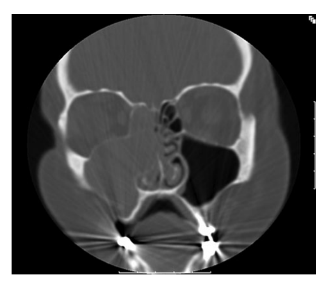
Fig. 1 Coronal computed tomography scan showing homogeneous right maxilla with elevation of orbital floor.