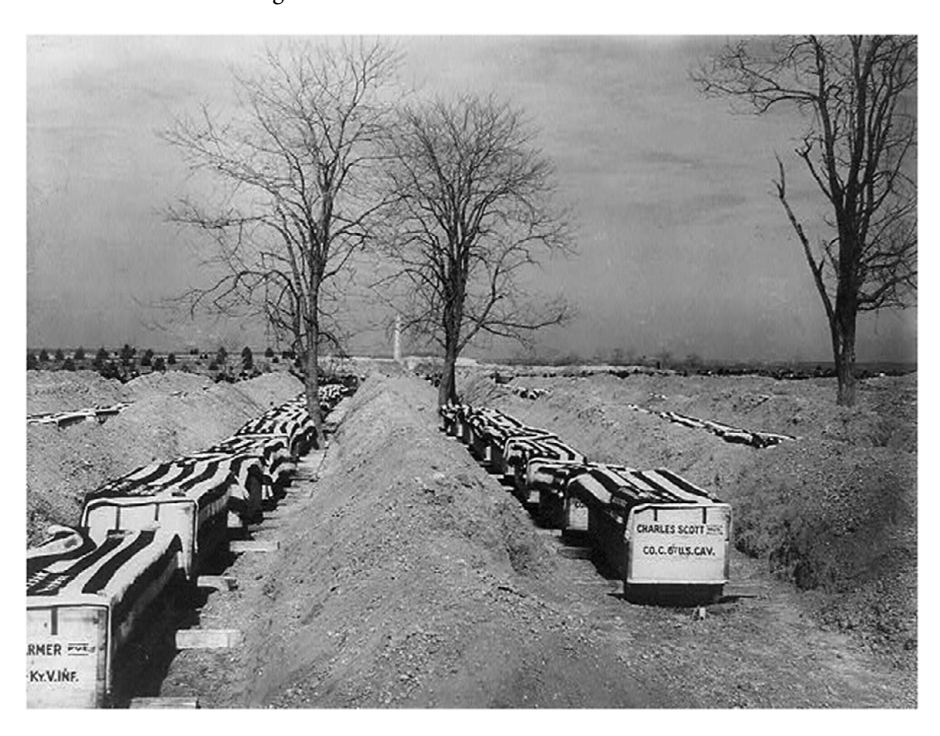
Figure 2. Caskets of U.S. soldiers from Cuba at Arlington National Cemetery pre-burial. Notice the etchings of names, wooden caskets, and U.S. flags draped over the caskets.