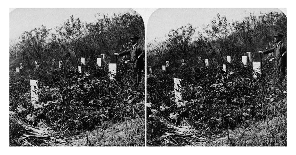
Figure 1. Overgrowth obscuring U.S. gravesites near Siboney, Cuba.

So-called "ingratitude" was the least of the problems for U.S. occupation in the immediate aftermath of combat. Disease spread unmercifully throughout Santiago, Cuba. In a sanitation report from the U.S. military, for example, issued just days after combat ended, U.S. officials described a horrible scene. In August, Sanitary Inspector H. S. Caminero of the U.S. Marine Hospital Service began issuing daily reports in which death rates dramatically increased among the general population of Santiago after the Spanish surrender, from fifty-three deaths on August 3 to seventy-eight deaths on August 7 to ninety-two deaths on August 10. Inspector Caminero could not identify the mysterious tropical disease that was ravaging native Cubans as well as foreigners in the city. Doctors