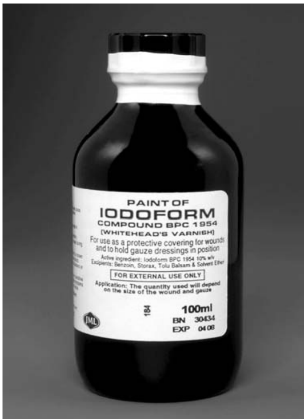
FIG. 1 Whitehead's varnish

Following excision of sinonasal tumours, we routinely pack patients' postsurgical nasal or paranasal cavities to secure haemostasis. The pack is left in situ for five to seven days on average, but larger cavities (e.g. after