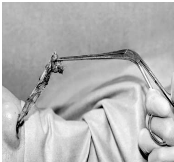
FIG. 3 Removal of whitehead's pack

craniofacial resection) may be packed for 10 days. Although Whitehead's varnish has an antiseptic effect, antibiotics are prescribed for the duration of the pack, as the ribbon gauze still represents a foreign body in the nasal cavity. Removal of the pack (Figure 3) should be performed under a general anaesthetic as it can be quite painful.