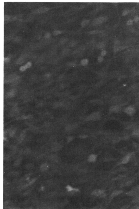
Figure 2 — Effect of galactocerebroside on the immunofluorescent staining of RG-cells with MS-serum. The RG-cells were acetone-fixed and treated with 25 µg/ml solution of galactocerebroside at 4°C for 30 min. After thorough washing with PBS, the incubations were done with MS-serum and FITC-conjugate as described in the text. (magnification X 158).

glial cells in MS-serum was originally demonstrated by using bovine brain cross-sections or isolated cells (Abramsky et al., 1977). In this study, 90% of