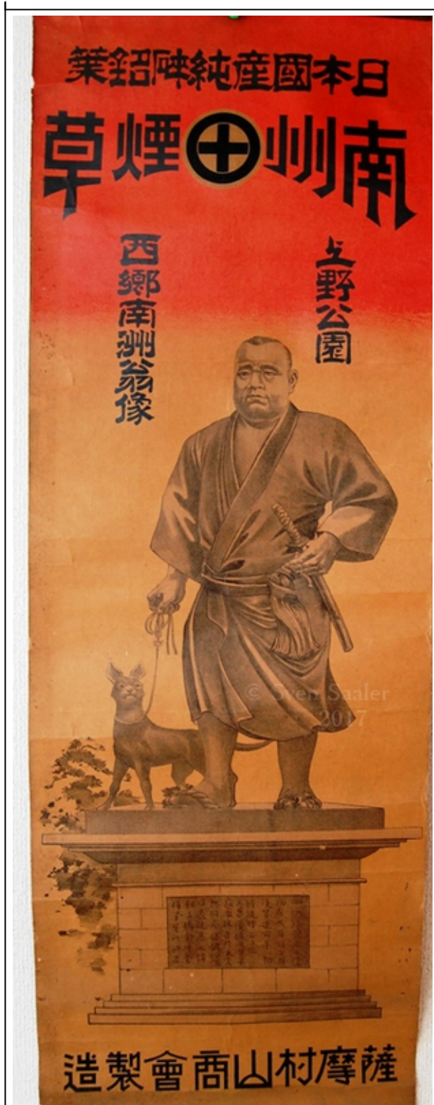
Tobacco advertisement showing the statue of Saigō Takamori in Ueno Park, Tokyo (late Meiji/Taishō period).

Although many prewar statues were destroyed during World War II, most of these early Meiji period statues survived to the present day. While they have become important landmarks symbolizing the sites where they stand, they also remain significant manifestations of the nation in public spaces, inculcating visitors with an official imprimatur of the idea of the nation. More importantly, their presence is not limited to the actual sites where they stand: they occupy a significant place in the mass media in modern Japan, being reproduced on woodblock prints (see illustration 2), lithographs, postcards (illustration 5), in tourist guidebooks and periodicals, on the internet and in advertisements (illustration 3), as well as on Japan's currency (illustration 4).