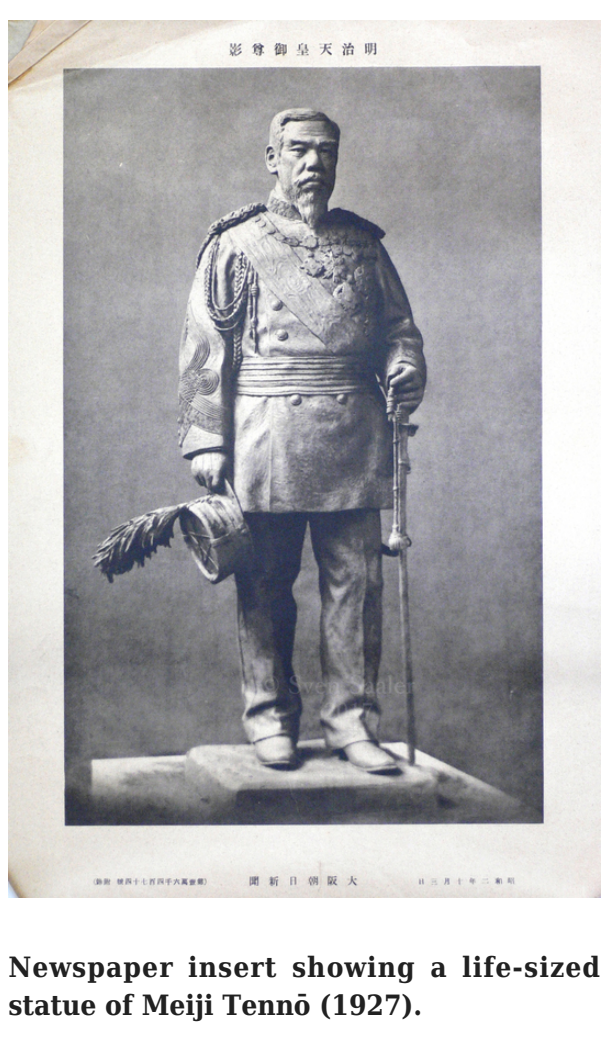
Newspaper insert showing a life-sized statue of Meiji Tennō (1927).

At least one copy of this statue at its original size (175 cm) was cast in later years and was owned privately by Tanaka Mitsuaki. In 1929, Tanaka founded a memorial hall dedicated to Meiji Tennō in Ibaraki, the Jōyō Meiji Kinenkan (Jōyō Meiji Memorial), and donated his Meiji statue to the museum, where the “Sacred Statue” ( seizō ) remains on display to the present day. (Today the museum is known as the Ōarai Museum of Bakumatsu-Meiji History or Bakumatsu to Meiji no Hakubutsukan.) 7