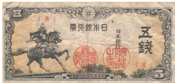
Five-sen bill of 1944 showing the statue of Kusunoki Masashige.

Although many prewar statues were destroyed during World War II, most of these early Meiji period statues survived to the present day. While they have become important landmarks symbolizing the sites where they stand, they also remain significant manifestations of the nation in public spaces, inculcating visitors with an official imprimatur of the idea of the nation. More importantly, their presence is not limited to the actual sites where they stand: they occupy a significant place in the mass media in modern Japan, being reproduced on woodblock prints (see illustration 2), lithographs, postcards (illustration 5), in tourist guidebooks and periodicals, on the internet and in advertisements (illustration 3), as well as on Japan's currency (illustration 4).