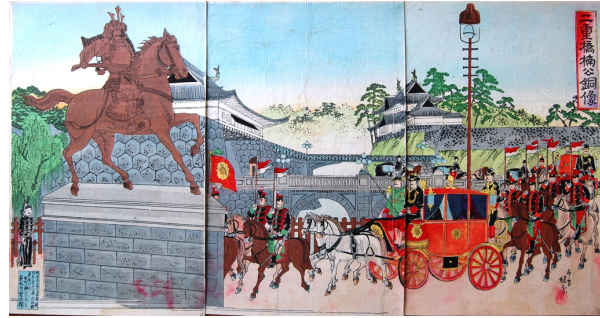
Statue of Kusunoki Masashige in front of the imperial palace, Tokyo (woodblock print, 1899, © Sven Saaler).

The site originally chosen for Saigō's statue was eventually occupied by the figure of a “true” loyalist to the imperial court - medieval warrior Kusunoki Masashige (1294-1336). Kusunoki's statue, however, was narrowly beaten in the race to become Japan's first equestrian statue by that of another feudal lord, the daimyo of Chōshū feudal domain, Mōri Takachika (aka Yoshichika, posthumous name Tadamasa, 1819-1871; see below). The Mōri statue was unveiled on 15 April 1900, while the Kusunoki statue was placed on its pedestal in May of the same year and unveiled in July. 3