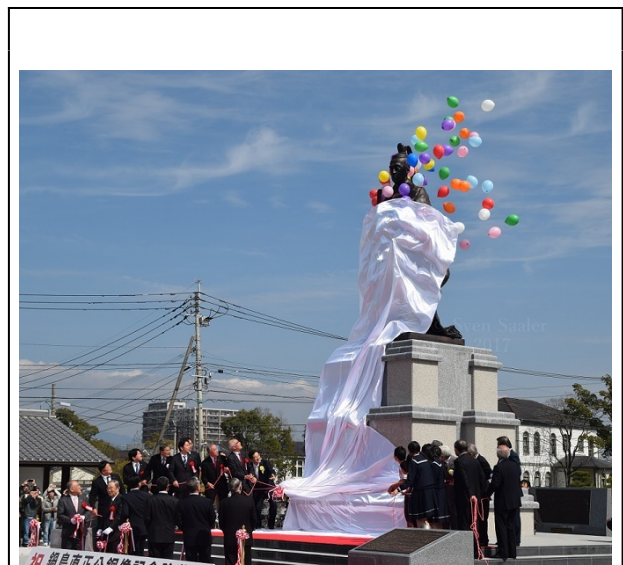
Unveiling ceremony for the statue of Nabeshima Naomasa in Saga, 2017.

Hikone, the capital of his former feudal domain, were demolished and melted down in 1944. However, given that he was instrumental in signing the first treaty between Japan and a foreign country – the United States, the leading power in the postwar occupation of Japan – the city of Hikone decided to erect a new statue of Ii. Completed in 1949, it was one of the first prewar statues to be reinstated. According to the inscription, it was erected as a memorial to a “pioneer of Japanese-American friendship,” emphasizing the legitimacy of Ii’s decision to open the country in the 1850s and signing a treaty with the U.S. Ii’s statue in Yokohama was rebuilt five years later, in 1954, and many statues of feudal lords that had been sacrificed to the war effort followed suit. The latest addition is a figure of the last daimyo of Saga domain, Nabeshima Naomasa (1814-1871), unveiled in March 2017.