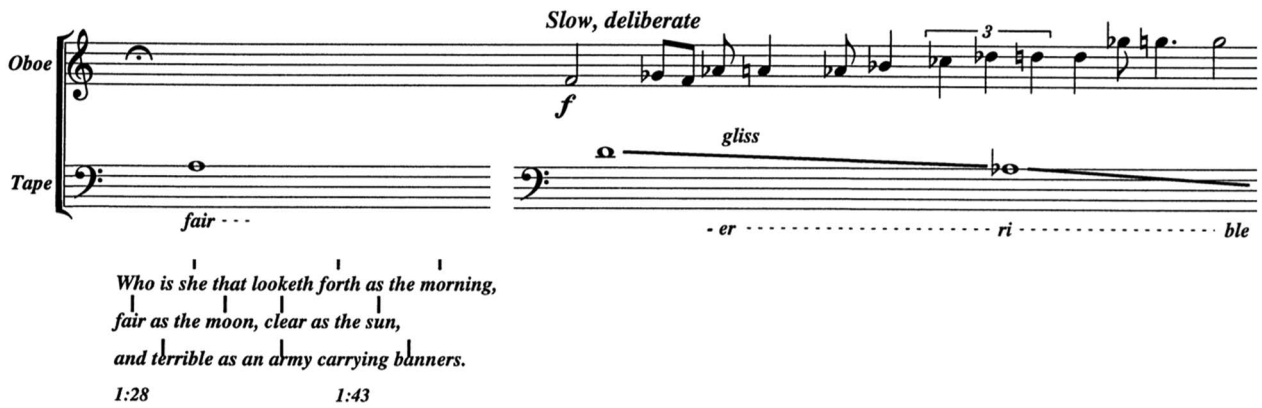
Figure 2. Song of Songs , i: ‘Morning’, line 5. Song of Songs , i: ‘Morning’, system 5. Transformation of perceived gender identity and sexual orientation in ‘fair’ and ‘[t]errible’ voices. Oboe d’amore in A.

upon thee’ (0:37 [i, 0:44 score]) 4 is recited by both speakers so as to evoke a polyamorous relationship with Shulamite, their female lover (Woloshyn 2012: 159–60). In system 5 5 of the first movement (1:31 [i, 1:28 score]), a man speaks ‘Who is she that looketh forth’, and we hear a corresponding interjection from a woman (Schiphorst) on the word ‘fair’ (Figure 2). The prominent pitch of this word sounds around A below middle C, or 220 Hz, with a characteristically feminine upward inflection, as determined by Wolfe et al. and subsequent studies. 6 The upward inflection of the ‘fair’ voice brings its fundamental frequency to D or 294 Hz, the pitch at which this voice is met by another voice (Ruebsaat), speaking the word ‘terrible’, absent the ‘t’ attack. Starting here, from the supposed female range (as determined by Wolfe et al.), and then gradually dropping in pitch by exploiting the original downward inflection on the word ‘terrible’, now made evident by a hundred-fold time-stretching and downward harmonisation, the ‘terrible’ voice descends through A and G flat to join the oboe for a moment before sliding progressively lower and out of the normative female range.