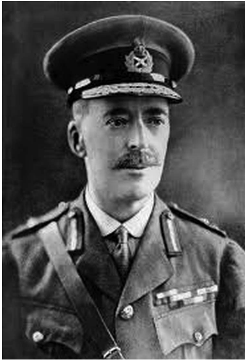
Fig. 1. Lieutenant General Sir William Boog Leishman KCB, KCMG, FRS.