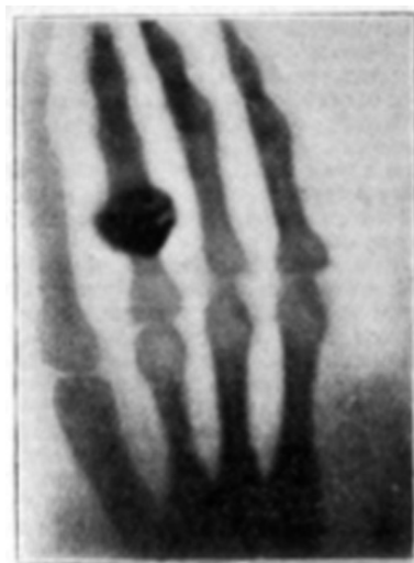
Figure 1 X-Ray image from Röntgen (1896, 276)

Röntgen's (or similar) experimentation will rest upon evidence gleaned from visual perceptual experience. Only the most skeptical of opponents would gainsay. (I am not claiming that we visually perceive X-rays.)