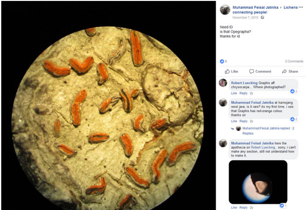
FIG. 1. Original post of the new species from Java in the Facebook group Lichens Connecting People . In colour online.

250 × 40–60 μm, oblong. Ascospores 8 per ascus, 13–15-septate, 100–140 × 20–25 μm, oblong, 4–6 times as long as wide, with thickened septa and lens-shaped to rectangular lumina, hyaline, I+ violet-blue.