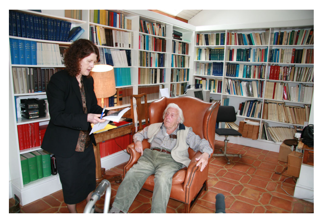
Figure 3: Interviewing Sir Derek Bowett at his home on 16 March 2007.

5 – To generate awareness amongst students and younger staff members of the rich heritage of the Faculty.