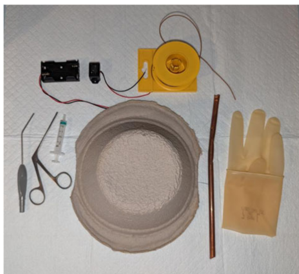
Figure 1. Components needed to build an enhanced low-fidelity ear simulator.

pipe and otomicroscopy instruments (aural microsuction and crocodile forceps). When the instrument tip touches the ear canal, which is painful and risks canal trauma in real patients, the buzzer alarms, thus providing objective performance feedback to the user. The instrument arms were painted to ensure that only the tip of the instrument set off the buzzer.