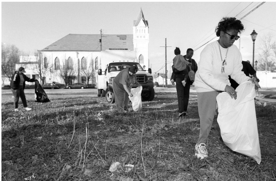
Figure 2. Northeast Augusta chapter of the Gospel Music Association of America, Inc., cleans up Brown's childhood neighborhood.