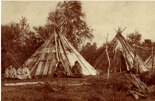
Uilta Village, early 20th century

Here is his description of the evening meal in a house in the Uilta village of Old Val, on Chaivo Bay: