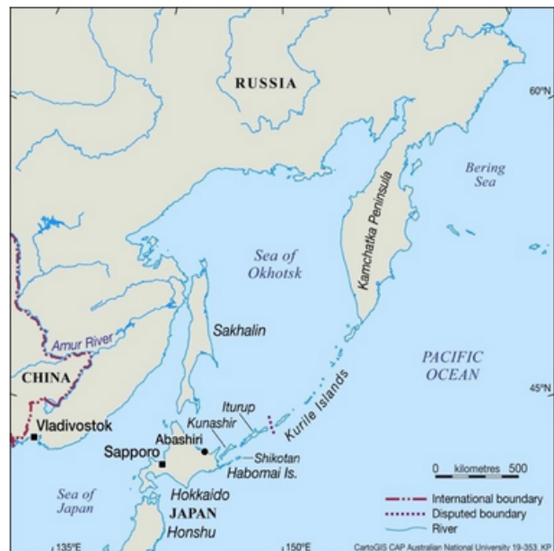
Eastern Siberia, Sakhalin and Kamchatka (CartoGIS CAP, Australian National University)

50th parallel (roughly half-way up its length) with the southern half being handed over to Japanese control. Between 1921 and 1926, during its post-Russian Revolution intervention in Siberia, Japan briefly extended its control to the whole of the island, but with the exception of this interregnum, Sakhalin was to remain divided between Japan and Russia until 1945, when the Soviet Union regained control of the whole island - a control which Russia retains to the present day.