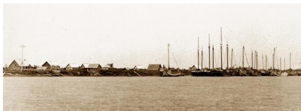
Japanese Fishing Vessels in the Siska Gulf on the Eastern Shore of Sakhalin, c. 1890