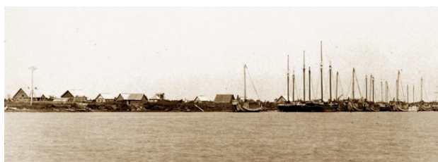
Japanese Fishing Vessels in the Siska Gulf on the Eastern Shore of Sakhalin, c. 1890