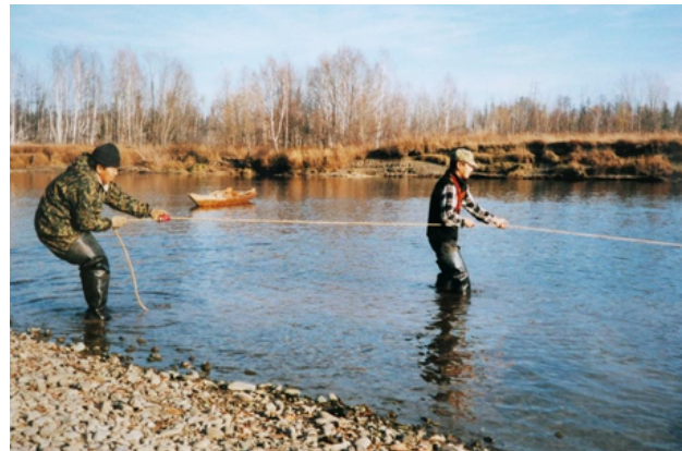
Nivkh Fishermen on the River Tym', Chir-Unvd, October 2001