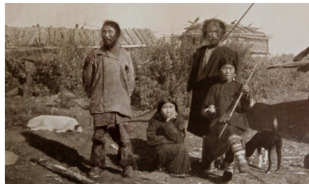
The Starosta of Nivo and his wives with another Nivkh man (from In the Uttermost East , opposite p. 272)

Hawes seemed fascinated by the children, and observed them closely, as in this word-sketch of dinner in a Uilta house in the nearby village of Dagi: 'The menu for supper was kita roe and rice mixed. We should call it caviar and rice served up in birch bark bowls. The tiny children found it difficult, with a cross between a chopstick and spoon, to get it into their mouths and the other hand was brought to bear to bundle it in'. 64 Meanwhile, the men of the household were washing down their meals by 'sipping tea from cups or saucers' 65 : compressed 'brick tea' was one of the most important items bought by Nivkh and Uilta villagers from Russians and other traders in exchange for fish and furs. 66