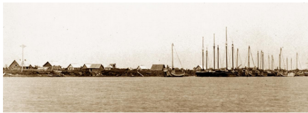
Japanese Fishing Vessels in the Siska Gulf on the Eastern Shore of Sakhalin, c. 1890