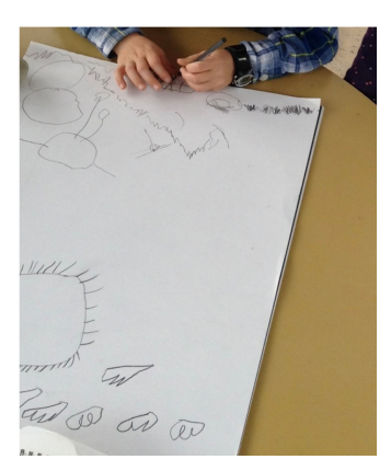
Figure 9. Collecting and arranging.

they began expressing a desire to "become toads." With this shift of interest—from educating others about caring for toads to becoming toads themselves—I began to share videos of toads with the children, giving them opportunities to see a toad's camouflage and movements in different environments, and hear the different sounds toads make to call one another. This movement fostered the children's relationality with toads—and they began to practice hopping, changing the ways in which they vocalised when calling to each other, and finding ways to camouflage with/in their surroundings. We transformed the school's gross motor gym into a toad space, collecting outdoor materials, using crates and fabrics to make "tall grasses" and potato sacks as "burrowing spaces," draping blue and brown fabrics for "ponds and muds," and arranging tree cookies for the children to hop to and from. The children were becoming toads, eventually calling themselves Toad A, Toad Z, Toad E and Toad B instead of their human names. We noticed the ways in which they leapt from their "hind legs" to land on their "front legs," their deep, full-throated calls to one another, and the different ways they travelled through the muds, grasses and waters. These embodied practices of thinking-with and moving-as toads provoked them to begin exploring dramatic play as toads, to act out toad stories. My assigned role in this play/storytelling was typically that of a predator, most often a snake.