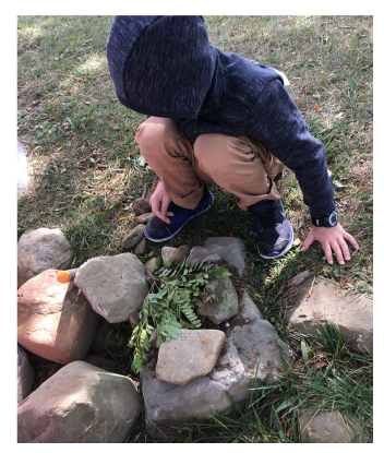
Figure 8. Making toad houses.