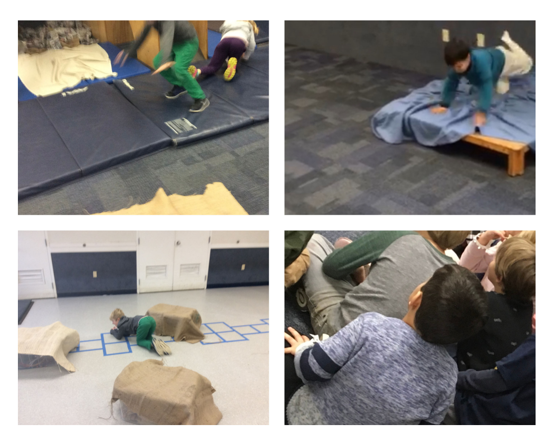
Figure 10. Toad play-stories.

playground where many of the children shared in these play-stories, collectively thinking-with toads and having conversations that integrated language related to toads' instincts, habitats and lifestyles.