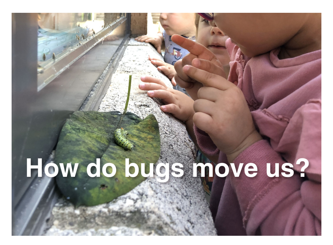
Figure 2. A photographic panel, showing children engaged with various bugs on an outdoor window ledge, with text reading, "How do bugs move us?"

Within the context of the United States in particular, what is accepted as early childhood "best practice" serves to uphold the binary between human and other non-human "things." This is especially persistent with regard to young children's engagements with plants and animals; these are conceptualised as instrumental matters, wherein children are hyperautonomous individual learners (Prout, 2005) and non-humans are relegated to the passive tools for children's science learning (Myers, 2018). But I was struck by adults' seeming inability to read the question as it was written. My question was intended to be an inquiry into our relationships with creatures, but it was being read as a test wherein animals were the object of study and the correct answers could be performed by children. Was this intentional? It happened so often that it seemed like a case of particularly humanist pareidolia —the phenomenon wherein we perceive something ambiguous as something familiar, such as seeing a dragon in the clouds or a human face in a rocky cliffside. I had anticipated that some might not want to engage with the question. But I had not expected that the workings of anthropocentrism would be highlighted in this way, so persistent that it was rearranging words somewhere between the way they were written on the page and spoken aloud and perhaps so stealthily that the reader wasn't even aware of the shift that had taken place.