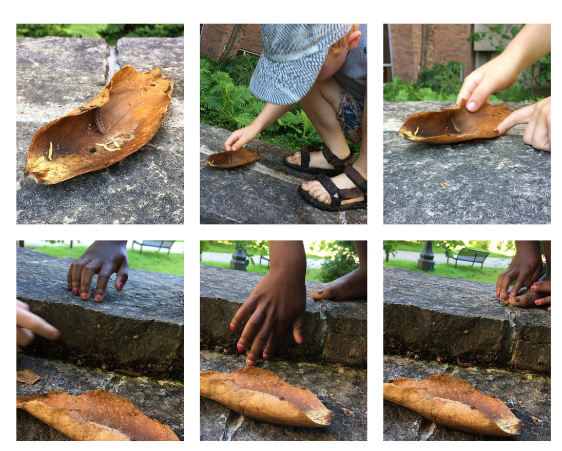
Figure 1. Caterpillar encounters.