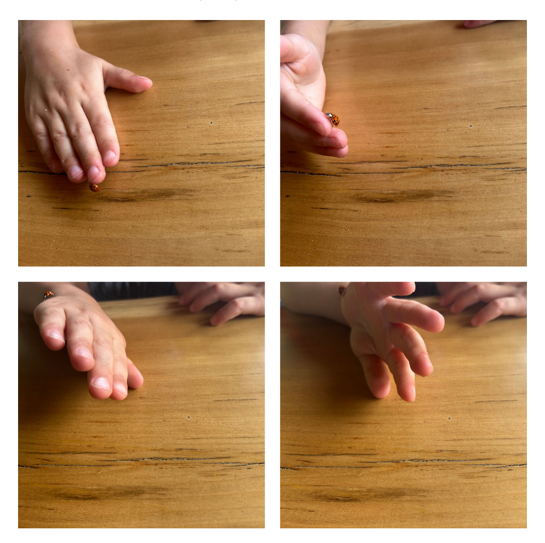
Figure 5. Driving all around.

I (Casey) am sitting at a table near the bookshelf with Alex. We are drawing with markers as part of the art experience I've been offering to this pre-school classroom. A spotted ladybug lands on his arm.