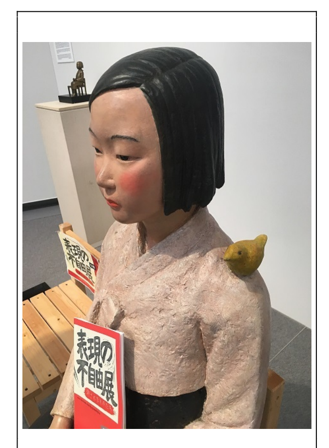
"Statue of Peace" (1&2) by Kim Seo kyung and Eun sung.

Aichi pulled the plug, citing public-safety issues.