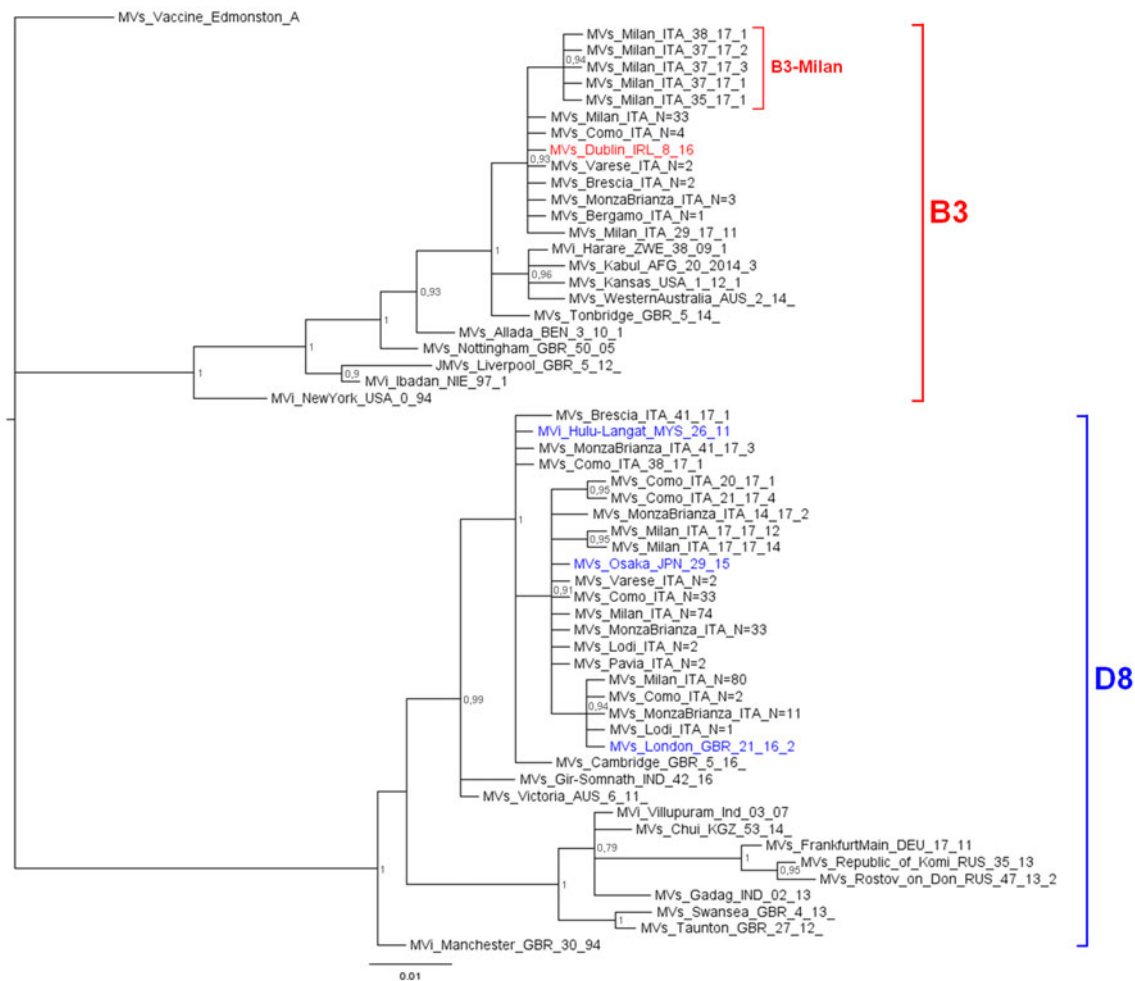
Fig. 1. Phylogenetic analysis of the Mv-sequences identified in Lombardy during 2017. The evolutionary history of 299 N-450 Italian sequences was inferred with MrBayes software using the Bayesian Markov chain Monte Carlo (MCMC) method and Hasegawa–Kishino–Yano (HKY) model. Posterior probabilities of clades are indicated next to the nodes. The WHO named strains related to Italian sequences are coloured (red for B3, blue for D8). Genotypes and novel variant are indicated by squared parenthesis. All sequences presenting 100% identity and obtained from the same city or geographical area were considered as one single sequence which report in the label the number of total strains.

six sequences, five were closely related to the named strain Osaka and one to the named strain Hulu Langat.