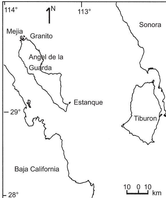
Fig. 1 Angel de la Guarda Archipelago, in Baja California, Mexico, with the location of Estanque Island.

mouse was 'relatively abundant and easily trapped' (pers. comm.). However, later surveys indicated that P. guardia was extinct (Mellink et al. , 2002). From the animals trapped in 1995, two females and two males were subsequently kept in captivity until they died in 1998, after which they were deposited as voucher specimens in the Mammal Collection at the Instituto de Ecología, UNAM. Additional fieldwork was carried out on the island in November 1998 (29 trap nights), November 1999 (40) and April 2001 (40; Mellink et al. , 2002), but no individuals were trapped. Given the island's small size and scarce vegetation, the trapping effort over a 4-year period is adequate and comparable with other studies on the California islands (Mellink 1992; Case et al. , 2002; Mellink et al. , 2002). During the 1998 field trip we collected c. 100 cat scats and saw one