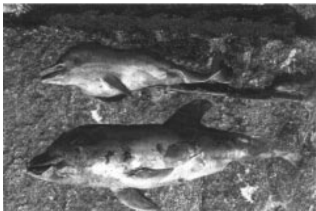
Figure 2. Male (46 cm total length, above) and female (72 cm total length, below) calves found dead in the uterus of the pregnant female.

once after the examination of 49 pregnant female beluga at the Churchill region of Hudson Bay (Doan & Douglas, 1953). Furthermore, an abortion of two calves from an approximately 10-y old beluga was reported by Dalton & Robeck (1996). On the other hand, analysis of 529 mature females of Globicephala melas revealed no incidence of multiple gestation, although abnormalities in the reproductive tract were sometimes observed (Sergeant, 1962). There was only one observation of twins in the tropical pilot whale Globicephala macrorhynchus (Escorza et al., 1994) and one in the sperm whale Physeter macrocephalus (Gambell, 1972). Concerning small Odontoceti, there are only three observations of twins of the bottlenose dolphin, Tursiops truncatus (Gray & Conklin, 1974; Ridgway & Benirschke, 1974; Amundin et al., 1989). This observation of multiple gestation in D. delphis is the first one reported to date after the dissection of more than 800 specimens of small cetaceans carried out in Galicia during the period 1990–1998. However, V. Cockroft (personal communication) has seen only one set of twin foetuses after dissecting more than 1500 specimens of different species of delphinids.