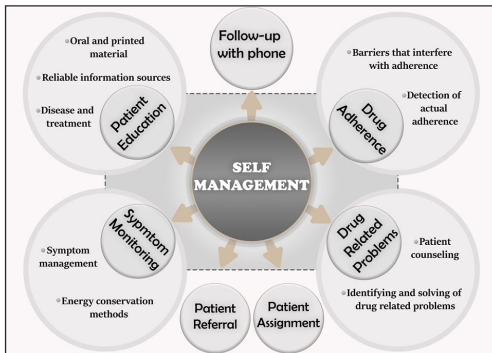
Figure 2. The multiple sclerosis self-management module.

(glatiramer acetate, interferon beta, teriflunomide, dimethyl fumarate and fingolimod) that are self-administered, in order to prevent overestimation of medication adherence by disease-modifying therapies that are administered at long intervals and require a health center to be administered. The Multiple Sclerosis Self-Management Revised (MSSM-R) scale 16 , the Patient Engagement Scale® (PHE® questionnaire) 17 and the Patient Assessment of Chronic Illness Care (PACIC) 18 scale were administered to the patients at the three interviews.