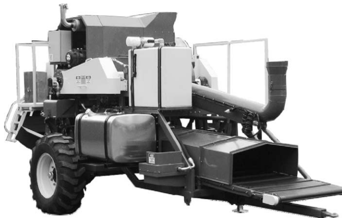
Figure 4. First commercially available Harrington Seed Destructor

Narrow windrow burning. The simple but effective narrow windrow burning system is currently the most widely adopted HWSC system in Australia. This inexpensive system uses a grain harvester mounted chute to concentrate all of the exiting chaff and straw residues into a narrow-windrow (500 to 600mm) (Figure 2a). These narrow windrows are subsequently carefully burnt under the right environmental conditions, avoiding burning the entire crop field (Figure 2b). The concentration of chaff and straw residues increases the duration and temperature of burning, creating the highest potential for weed seed destruction. Weed seed kill levels of 99% for both annual ryegrass and wild radish have been recorded from the narrow windrow burning of wheat, canola, and lupin ( Lupinus angustifolius L.) chaff and straw residues (Table 1, Walsh and Newman 2007). The simplicity and low cost of this narrow-windrow system has resulted in its adoption by an estimated 70% of crop producers in the major grain production state of Western Australia.