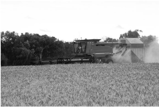
Figure 1. Chaff cart system in operation during commercial wheat crop harvest.

how a major herbicide-resistant weed problem has been the catalyst for the development of new non-chemical weed control techniques focused on weed seed capture and destruction during commercial grain crop harvest. We illustrate how the inclusion of these techniques in weed control programs allows weed populations to be driven to and maintained at very low levels. Finally, we speculate on the potential for at-harvest weed seed targeting technologies in global field crops.