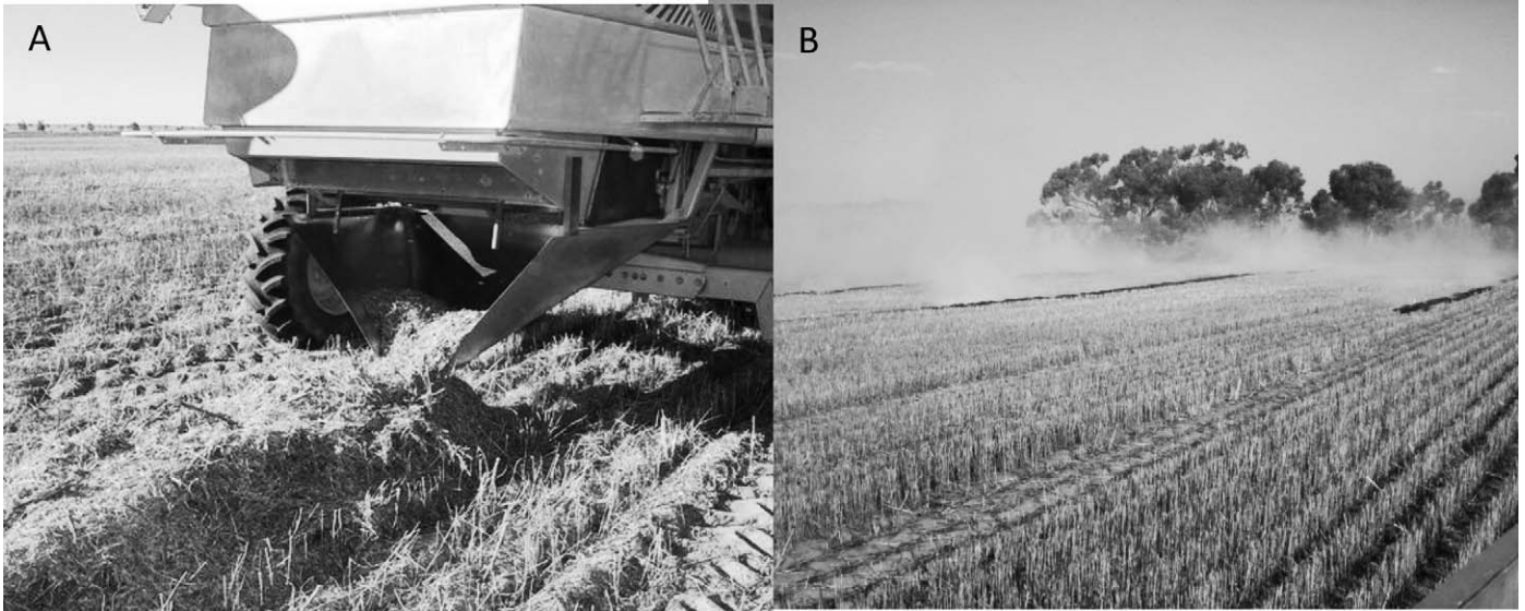
Figure 2 a) Chaff chute mounted on the rear of a harvester to form narrow windrows during harvest. b) Burning narrow windrows in wheat stubble in autumn (March to April)

Smith 1975). The biological attribute of seed retention at maturity in annual ryegrass, wild radish, and several other annual crop weed species, means that seeds are attached to the upright plant enabling the weed seeds to be collected (harvested) during grain crop harvest. For example, in field crops a large proportion (up to 80%) of total annual ryegrass seed production can be collected during a typical commercial grain harvest (Walsh and Powles 2007). These weed seeds enter the front of the grain harvester, are processed, and exit the grain harvester in the chaff fraction. An irony is that these “harvested” weed seeds are evenly redistributed across the crop field to become future weed problems. Thus, grain crop harvest presents an opportunity to target weed seed production, thereby minimizing replenishment/increase of the weed seedbank. As outlined below, harvest weed seed control (HWSC) systems have been developed in Australia to target and destroy weed seeds during commercial grain crop harvest, minimizing weed seed inputs into the seedbank (Walsh and Powles 2007).