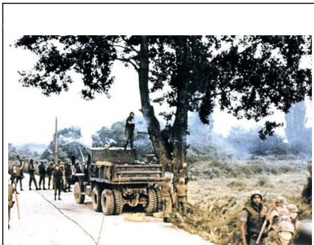
The cutting of the poplar tree at Panmunjon in Operation Paul Bunyan,

Key Resolve is scheduled to commence on March 13, 2017 and lasts until some time in April 2017. It will involve 17,000 American and more than 300,000 South Korean troops,—said to be pegged at the same scale as 2016. 2 According to media reports, Key Resolve “will simulate a full-scale war scenario that assumes the deployment and readiness of THAAD, the U.S. missile defense system, at its designated location in central South Korea.” 3