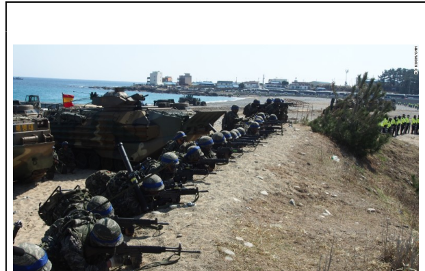
US & South Korea amphibious exercise, March 2016

It is therefore urgent that deliberate and systematic measures be taken to control the risk of military confrontation and escalation during these exercises. These measures relate to nuclear command-and-control; bombers; petroleum-oil-lubricants and logistical support; US missile tests; invitations to third parties, especially China and Russia, and non-governmental organizations, to observe; full advance and daily briefings by USFK on exercise script; rhetorical restraint by US political and military leaders; other forms of reassurance such as proposing reciprocal military exercise and force reductions; strict control of how the revised rules of engagement are applied under the current conditions of political oversight by the ROK government; and preparations to halt or adjust exercises if something goes badly wrong.