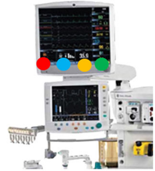
Figure 1. Visual location of samples collected from the anesthesia machine vitals screen.

After Deactivate: Area facing the sampler on the right most quarter of the screen