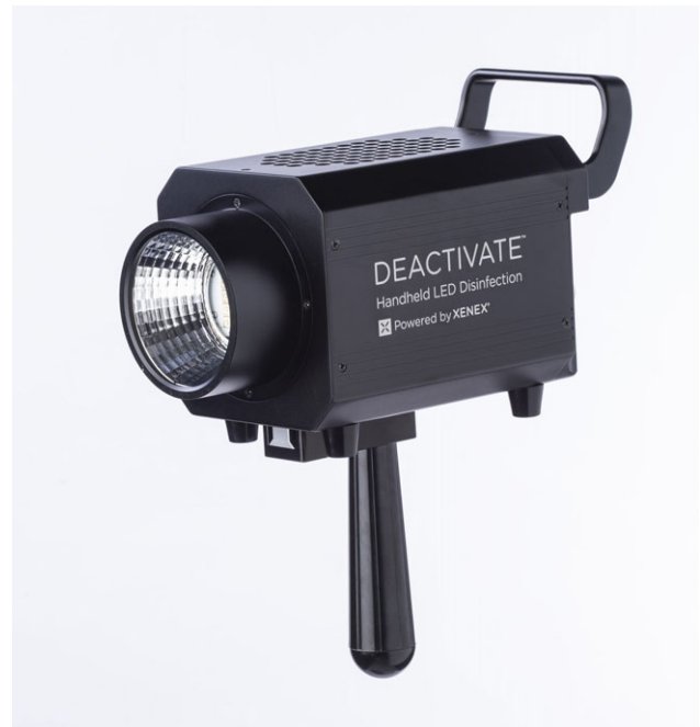
Figure 2. Handheld ultraviolet light-emitting diode device used for this study.

This study was approved by our institutional review board prior to initiation. The study was conducted between 03/02/2021 and 04/20/2021. This study was performed in a prospective manner. HTSs near the operative field that were the least likely to be thoroughly cleaned were identified from a previous study at our institution 8 which included: anesthesia machine vitals screen, supply cabinet doors, nurse’s documentation station, electrocautery control unit, and the anesthesia cart table. These HTS had specifically