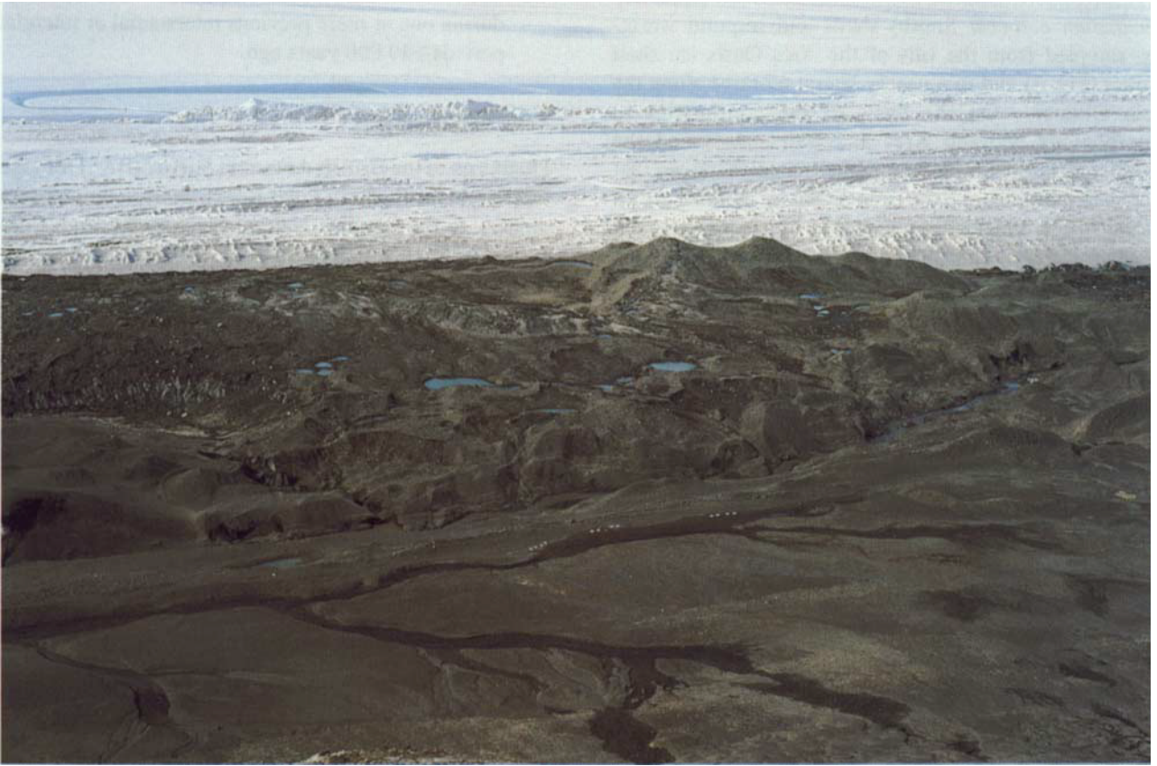
Fig. 3. George VI Ice Shelf and the ice shelf moraines (here c. 250 m across) at Ares Oasis.