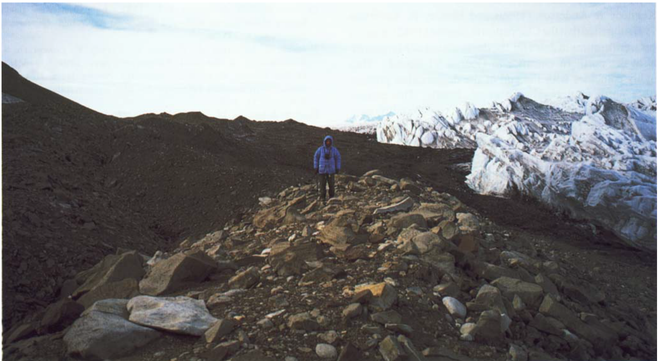
Fig. 4. Upthrust marine sediments with upthrust ice shelf margin in the background and geologist for scale, at Mars Oasis.