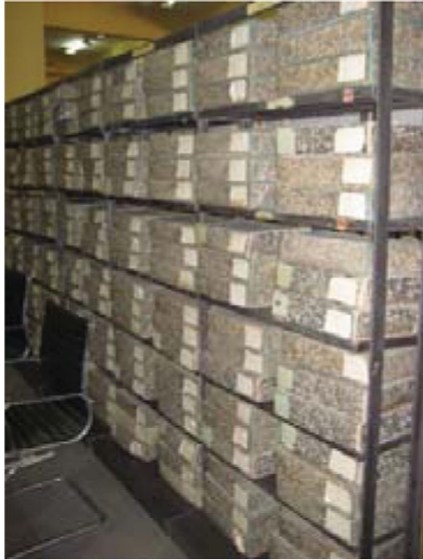
Fig. 3 (Colour online) 'The books are too heavy for the photocopier'