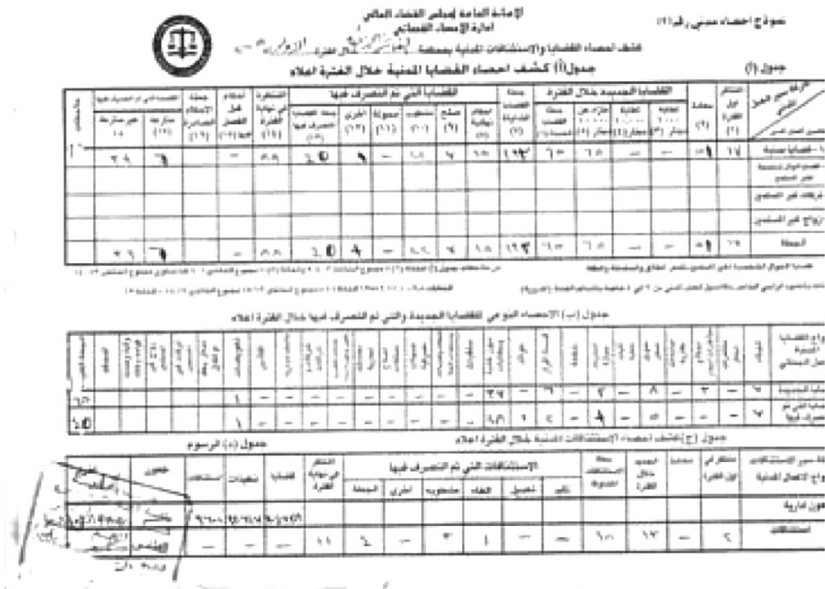
Fig. 1 Overview of crimes prosecuted in North Darfur