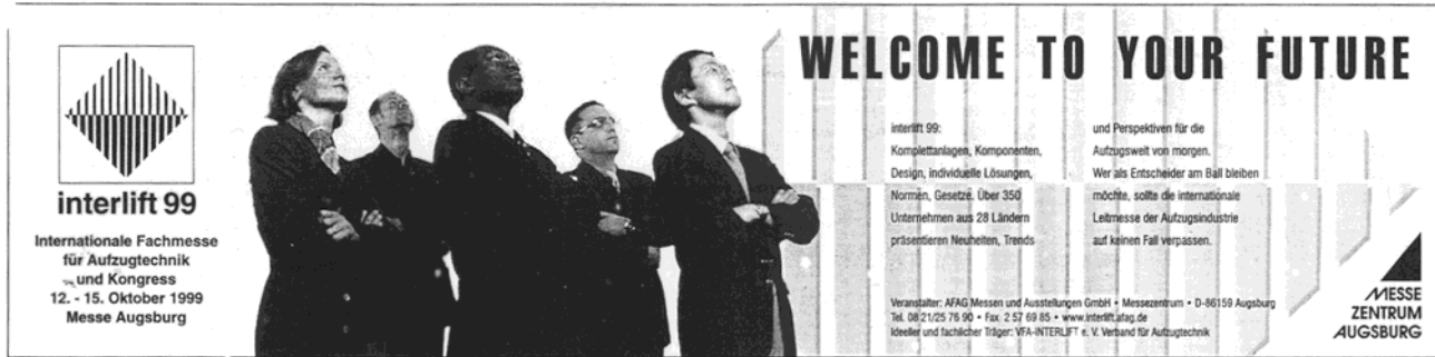
FIGURE 2: Advertisement for interlift 99.