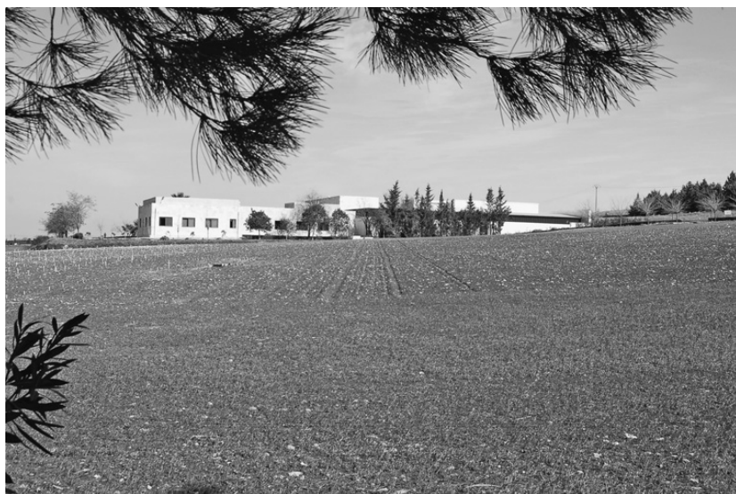
Figure 1.1 A view of ICARDA's facilities in Tal Hadya, Syria, 2007.

Born of the Cold War, ICARDA emerged from exercises of European imperialism, Great Power rivalries, and the concomitant restructuring of a patchwork of modern nation-states in Western Asia and North Africa. In the aftermath of World War II and European withdrawal from formal governance, newly independent nation-states became battlegrounds of the Cold War. The southern rim of Asia, which provided a buffer to the Soviet Union, became a focus of US strategies of containment from the 1950s. Scholars have attended to the global movement of soldiers, arms, and aid that fueled Cold War conflict in the “killing fields” of the Asian rim. 3 They have paid less attention to the ways in which the institutional development of international research organizations served Cold War objectives. 4 The founding of ICARDA was part and parcel of the