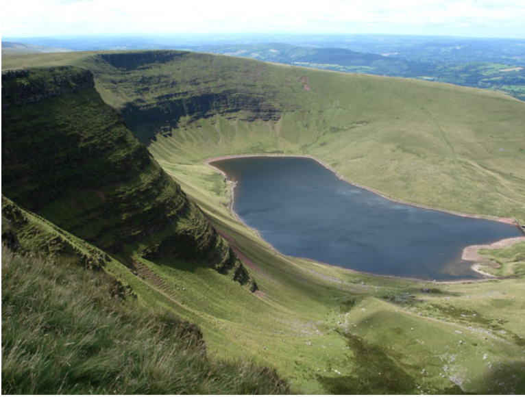
Figure 1. Llyn y Fan Fach, from Picws Du looking towards Waun Lefrith (22 July 2020).

The following summary of the legend, by Sioned Davies, is based on a version collected by William Rees in 1841: