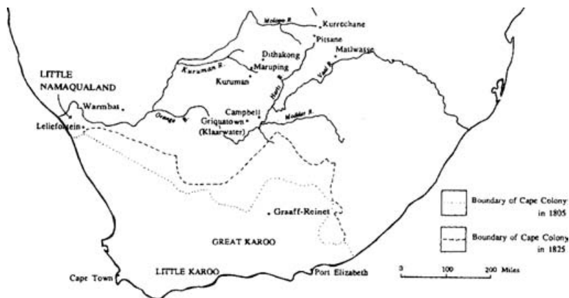
Figure 1 Map of South Africa in the early 19th century.

In recuperating that journey, we seek to make visible the hidden hand, sometimes the sleight of hand, behind the political economy of 19th-century European colonialism. Which returns us to the broad outlines of our argument: (i) inasmuch as the building of empires depended on processes of commensuration, on rendering epistemically equivalent and transitive once incomparable objects and ideas, signs and meanings, it demanded media – beads, coin, contracts and the like – with the capacity, simultaneously, to construct, negate and transfigure difference; and (ii) inasmuch as those media, those currencies of conversion, opened up new lines of distinction, new languages of value, new forms of inequity, new objects of desire, new possibilities of appropriation and exploitation, they took on magical properties; this because (iii) they appeared, in and of themselves, to objectify history-in-the-making, even to make history of their own accord. Which, we shall demonstrate, is why banknotes, beads and bovines became the objects of a protracted struggle in the South African interior; why, more generally, they became metonymic of the differences of value on which the colonial encounter, tout court , was played out.