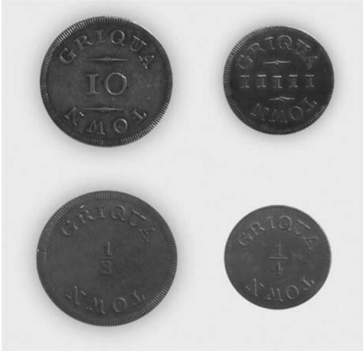
Figure 2 Examples of Griqua Town coins.

the missionaries would take for their allowance from the Society, having Griqua town marked on them. It is probable that, if this were adopted, in a short time they would circulate among all the nations round about, and be a great convenience.