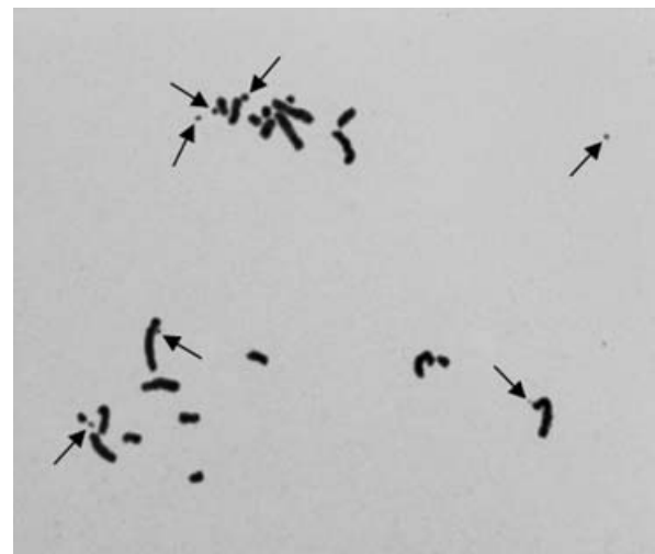
Figure 3 Multiple chromosome fragments (arrows) in the metaphase plate derived from dead Bryde's whale spermatozoa.

The rate at which hybrid zygotes were able to reach the first cleavage metaphase was 92.6% (63/68) in the motile sperm group, 82.5% (52/63) in the immotile sperm group and 87.7% (64/73) in the dead sperm group. All the metaphases in the immotile sperm groups were karyoanalysed, while one and four metaphases in the motile and dead sperm groups, respectively, were unsuitable for chromosome analysis owing to the underspread of chromosomes. As shown in Fig. 2, whale sperm chromosomes duplicated and well condensed within mouse ooplasm. The haploid chromosome number of the Bryde's whale was 22. They consisted of 18 metacentric, submetacentric or subtelocentric chromosomes and three acrocentric or telocentric chromosomes. The Y chromosome was the smallest one, and the X chromosome was regarded as a medium-sized metacentric chromosome. Table 2 shows the results of the chromosome analysis. Out of 62 hybrid zygotes in the motile sperm group, 59 (95.2%) had a normal chromosome complement, and two (3.2%) had a chromosome break and a chromatid exchange, respectively. On the other hand, the incidence of spermatozoa with a normal chromosome complement was significantly reduced to 63.5% in the immotile group and 50.0% in the dead group due to the remarkable increase of