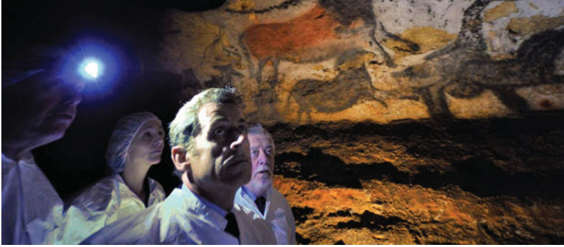
Figure 1 Despite the recent human-induced damages to its Palaeolithic paintings, the cave of Lascaux remains a veritable lieu de mémoire (see Demoule 1992). Former French president Nicolas Sarkozy fittingly took the opportunity of his visit (on 12 September 2010) to announce that the Maison de l'histoire de France will be based in central Paris, on the site of the National Archives.

carried forwards by the thankfully short-lived quasi-Orwellian 'Ministry of Immigration, Integration and National Identity'.