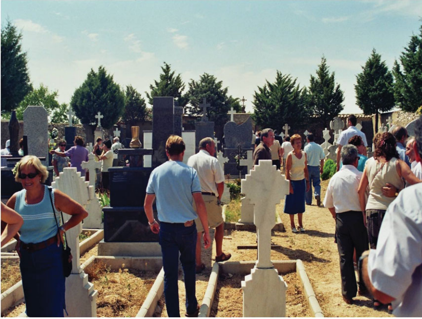
Figure 1. A reburial ceremony for Republican civilians killed in the Spanish Civil War, Burgos Province, Castile-Leon, Spain.

Catholics' (Renshaw 2011, 206). This is a striking phrase as it is a direct appeal to an archaeological sensibility, an awareness of the responsibilities inherent in any intervention which destroys the material record of a historical event and constitutes in its place a new one which will be interpreted by future generations.