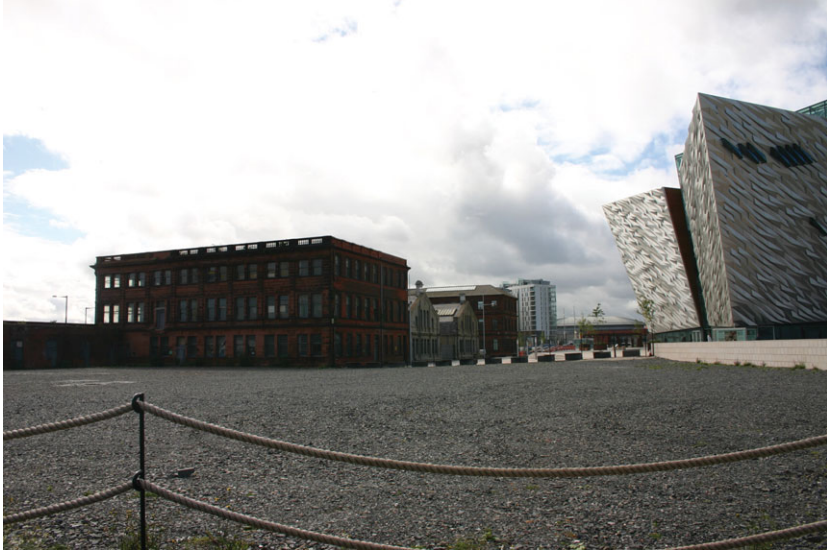
Figure 1 Derelict Harland and Wolff drawing offices (left) adjacent to the new Titanic Belfast building (right).