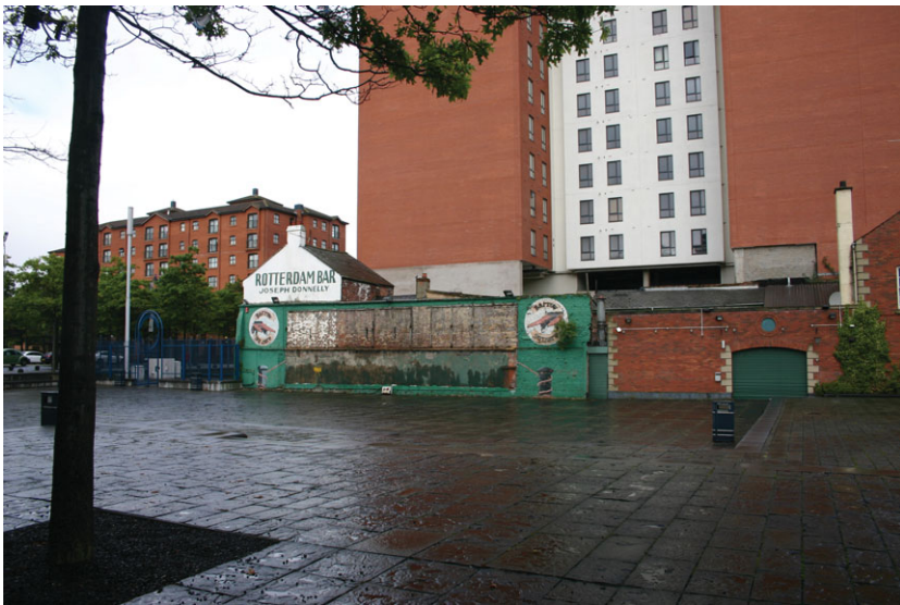
Figure 2 Sailortown's Rotterdam Bar.

regard Belfast may be little different to other post-industrial cities struggling with redevelopment, it is the relationship of sectarianism in the maritime history of Belfast that lends particular relevance to addressing the significance of its built heritage. During the heyday of the Belfast shipbuilding industry, the skilled jobs were overwhelmingly dominated by Protestant workers. Discriminatory labour practices gave rise to sectarian riots in the shipyards,