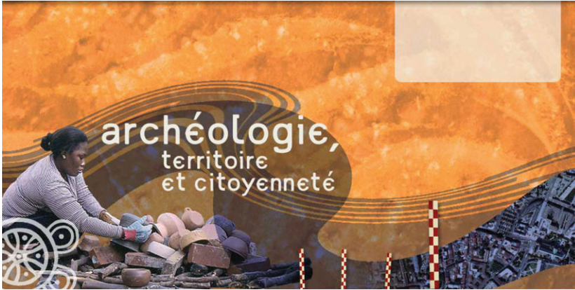
Figure 2 Between the burial grounds of French kings and the national football stadium, the town of Saint-Denis, north of Paris, embodies some of the complexities of 'localism'. As an attempt to enhance sentiments of citizenship through territorial practice, this Côte d'Ivoire-born potter (one of the 25 per cent of the town's population born outside France) exercises her traditional skills to reproduce local medieval ceramics for sale to international tourists (© Unité d'archéologie de la ville de Saint-Denis/Ministère de la culture et de la communication).

and political kinds have been facts of daily life long before some bluestones were dragged down the Salisbury Plain?