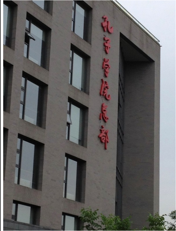
Hanban headquarters.