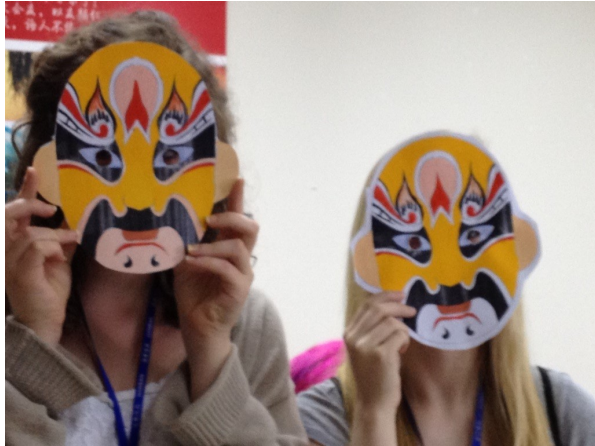
Opera mask activities.

As I watched the students perform China through these activities over the span of our visit, it increasingly became clear that the practices intended to promote soft power had actually backfired in several ways. While this may have been a result of cultural differences in expectations—with American students perhaps less tolerant of repetition and uniformity than their hosts expected—their effectiveness also appeared limited by Hanban’s strategy of defining authenticity as “Culture with a capital C,” demonstrated by these projects’ failure to produce the intended admiration and appreciation. “Do we really have to do this?” one student moaned as an instructor pulled out piles of red paper and boxes of scissors to explain traditional Chinese paper-cutting techniques, complaining that “I’ve done this so many times.” To spur interest, one of the chaperones suggested having a competition for the best paper cut, but it seemed to have little effect, as evidenced by a row of boys in the back napping with their heads on the tables. And on opera-mask-painting day, students engaged not only in eye rolling and nap taking, but also, to the displeasure of the teachers, took considerable poetic license with their projects, several of which more closely resembled characters from