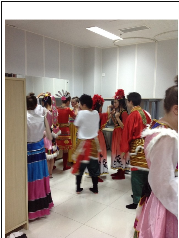
Preparing for the grand performance.

finale performance that would be presented in Beijing on the last evening of our stay. Local instructors had choreographed traditional and modern dance routines and selected students to perform, dressing them in traditional Chinese minority and Han costumes accessorized with feathered fans and elaborate headdresses. I grinned as I watched one Chinese American student, outfitted in a leopard-print costume, leap across the floor and proclaim himself the “Asian Macklemore,” a reference to the Seattle-based American rapper, and grimaced as I overheard the following exchange between two students: “What do we win if we’re the best group?” “Nothing. They make you stay in China longer.”