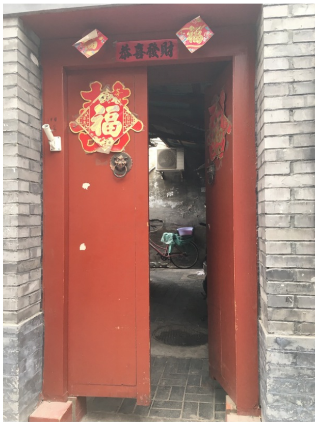
The entry to a residential courtyard in the hutong near Houhai

In my story, the provincial rogue who pursues the lovely but elusive Huamei is very much in the Gatsby mold. He breaks out of the prison-like confines of a rural work farm in Inner Mongolia, and, in cahoots with corrupt police, engages in blackmail while operating a string of lucrative entertainment venues. In keeping with Beijing's tacit segregation of types of people and types of activity, his flashy world of discos, karaoke joints and private clubs is situated on another square of the giant chessboard, namely Sanlitun, a zoned diplomatic district in the tradition of the old walled Foreign Legation, one of those hybrid areas in which Chinese and foreigners could mix relatively freely in the 1990s, at least up to a point, after which the rise of exclusive clubs created new forbidden zones.