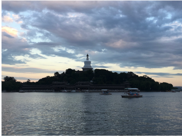
A view of Jade Flower Island (Qionghuadao) as seen from a pleasure boat in Beihai

archaeological remnants can be found nestled in a district still defined by walled compounds, man-made hills and lakes. The epicenter of the old, old city corresponds with Beihai Park today, and it is there that the denouement of the novel takes place.