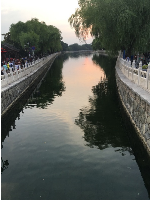
Houhai as viewed from Yinding Bridge looking west

“The Lakes of Beijing” is the product of many years residence in Beijing at a time when the poles of my existence oscillated between moments of inclusion and exclusion, times during which I violated the norms of both journalism and academia by allowing myself to be an observer turned participant. Needless to say, one could not have had as freewheeling a time as I had in Beijing without occasionally skirting the law and violating prevailing norms of separate but unequal existence. It is precisely the enduring system of Chinese boxes within boxes that I wrestle with in this novel.