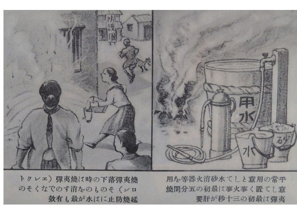
Figure 2. A prewar Japanese pamphlet on “household air defense” similarly instructs women in how to extinguish firebombs with buckets of water, sand, and hand pumps.