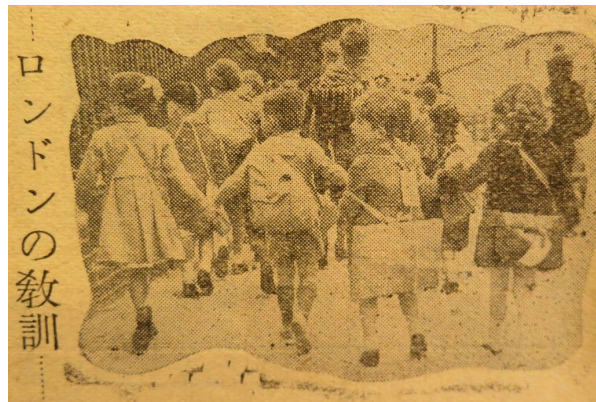
Figure 5. “The Lessons of London.” In this 1944 article in the Japanese government’s civil defense magazine, a diplomat previously stationed in the Japanese embassy in London describes what his countrymen might learn from the evacuation of children from British cities at the start of World War II.

Source: Tobe Toshio, “Rondon no kyōkun,” Kokumin bōkū 6, no. 7 (July 1944): 37.