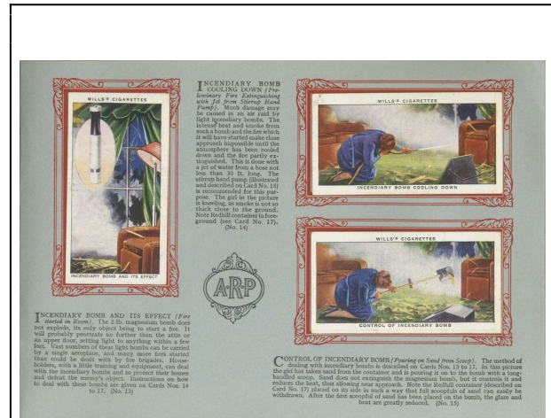
Figure 3. Commissioned by Britain’s Home Office, these prewar cigarette cards—found in cigarette packs—illustrate methods by which women could neutralize incendiary bombs that crash through the roofs of their homes. The use of stirrup pumps and sand closely resemble German techniques in Figure 1.